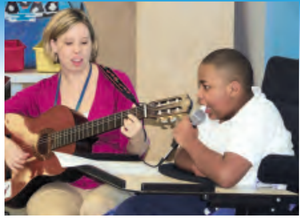
Children at the Center are valued, cared for and loved in the spirit of Saint Elizabeth Seton and the Sisters of Charity of New York. In the words of Saint Elizabeth Seton: "Tenderness is the language children best understand."

A. Staff pediatricians oversee specialties of cardiology, neurology, ophthalmology, orthopedics, otolaryngology, and pulmonary medicine. When necessary, they arrange for follow-up care with a subspecialty service at a referral hospital. Our highly skilled nurses have specialized training in tracheotomy care, oxygen therapy, pulse oximetry monitoring, nasogastric and nasojunal gastrostomy, total parenteral nutrition, and intravenous therapy. Our nurses provide counseling and training to family members, especially when a child is preparing to return home.